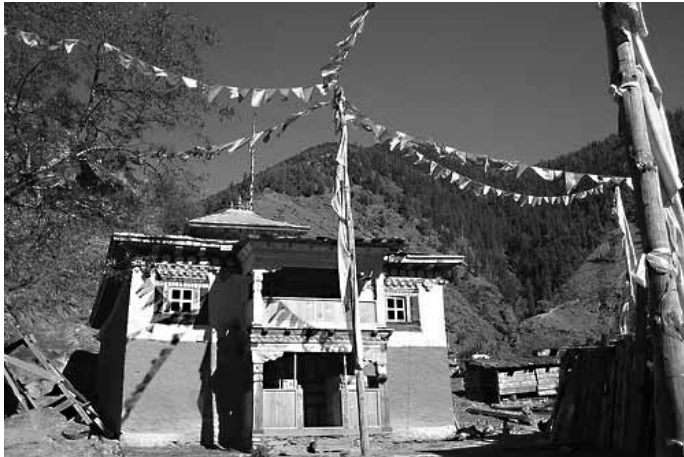
Yungdrung Droling Monastery in Hurikot

On requests of local people the Taprizia NGO and Friends of Dolpo are also supporting additional projects besides the school. These attempt to preserve local cultural heritage, ameliorate the health care or offer trainings for the adult section of the community.