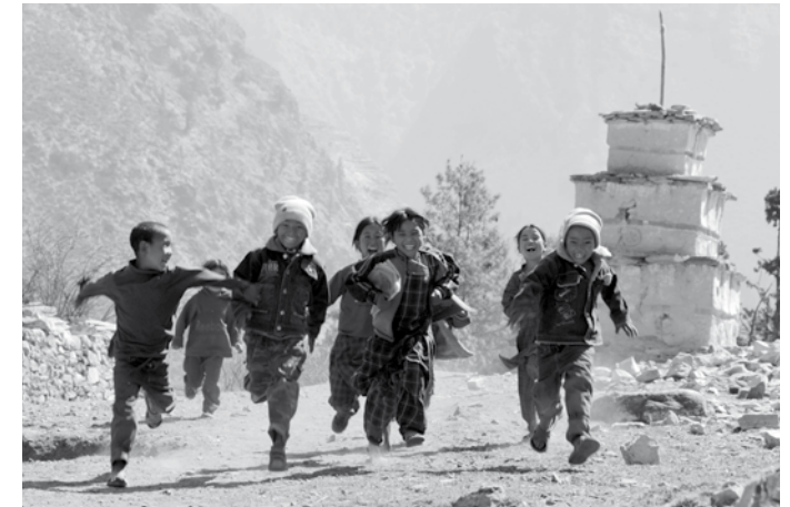
Fun and games during school break

Since 1998 the Taprizi NGO (CH) and Friends of Dolpa (USA) support the establishment and maintenance of the Taprizi School in Dolpo. The school offers a Tibetan speaking minority of Nepal the possibility to integrate their language, history and culture into the school lessons. Therefore, besides the national school curriculum their local tradition is passed on to the coming generation. An important aspect of the latter is the Bon religion practiced there today. Consequently, the school is named after the early Bon master Taprizi (tib. Ta-pi-hri-tsa).