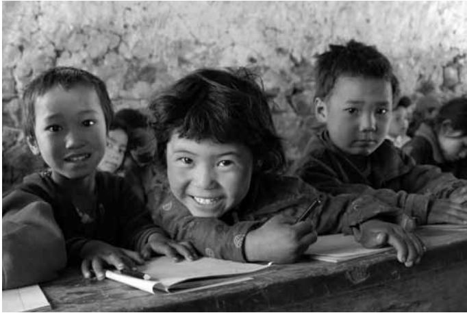
Everyday life at school