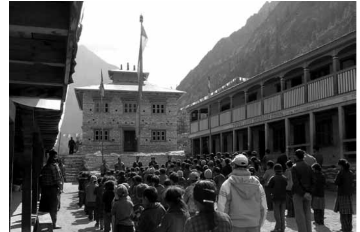
The schoolhouse with the new multipurpose building and the yard

In Nepal all students attend the same state annual exams from Class 8 onwards. The first Taprizia students took these exams in 2007. From the 300 participants of the district Dolpo three Taprizia students passed with distinction and achieved the first, second and fourth place – a small sensation for students whose mother tongue is not Nepali. These results reveal the high quality of education at the Taprizia School causing the school enrolment to increase annually.