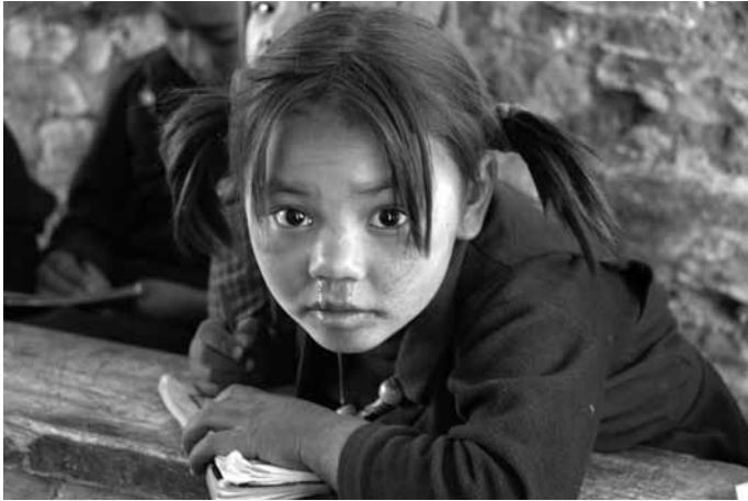
During a school lesson