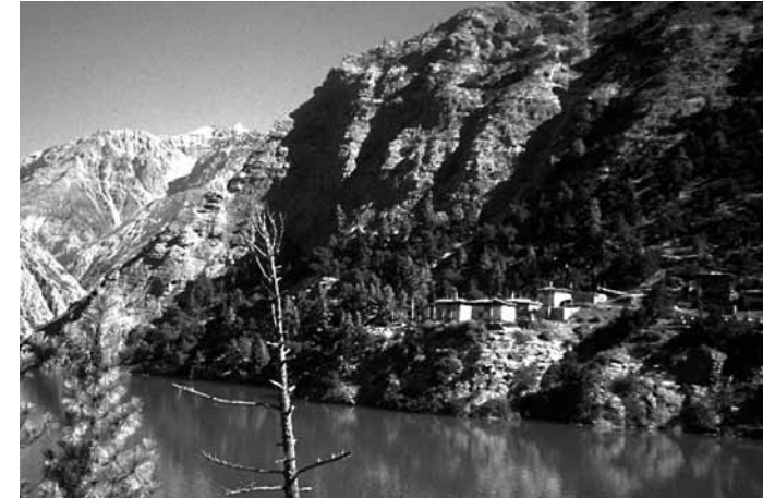
Thasung Tsholing Gompa, monastery by Phoksumdo lake