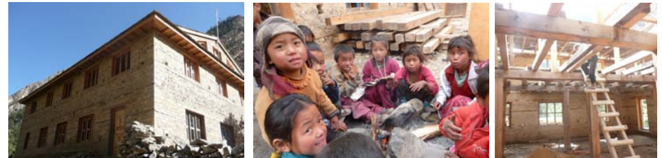
The new kitchen building.

In the year 2011 the new two-storey kitchen building was completed. After the foundation was already laid in the year before, the structural work was finished in 2011. In the lower storey there is a kitchen for students and teachers respectively as well as a spacious dining hall in which all the children can now eat together. The floor and the lower portion of the walls were concealed with cement to make the cleaning easier. In the top storey there are rooms for food storage and a dining room, offices and bedrooms for the teachers as well as a new solar battery station. Solar panels are installed on the corrugated iron roof. In the year 2012 interiors need to be done, partition walls, fire places (ovens) in the kitchens, cupboards, tables, benches and other furniture are still missing. Further both kitchens still need a chimney. Just in time for the near completion of the new kitchen construction two new cooks were employed at the school.