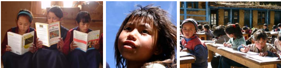
The school lessons continue as usual... the students savour reading... but enjoy the exams less.