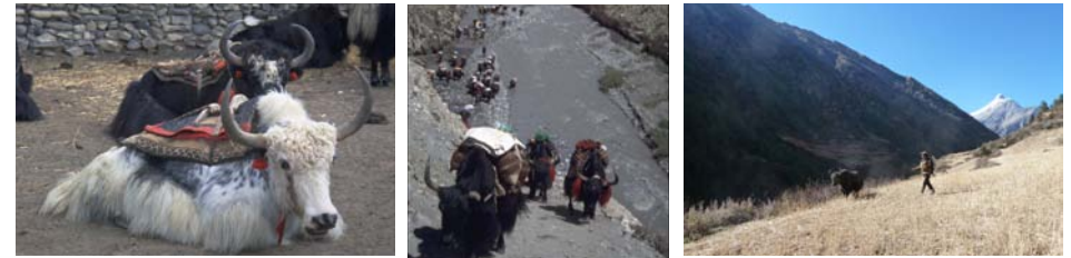
As transport animals and suppliers of wool, people in Dolpo rely on yaks for their livelihood.