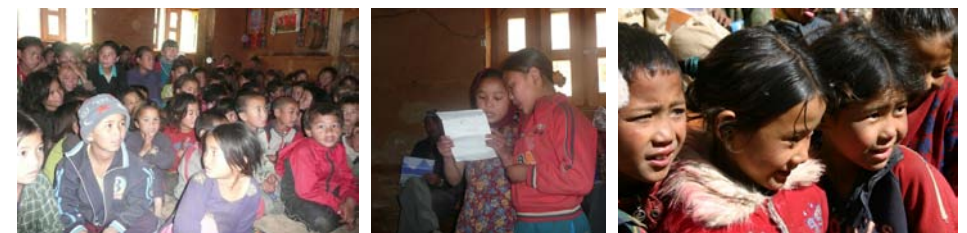
The children listen to the singing competition at the school with enthusiasm.