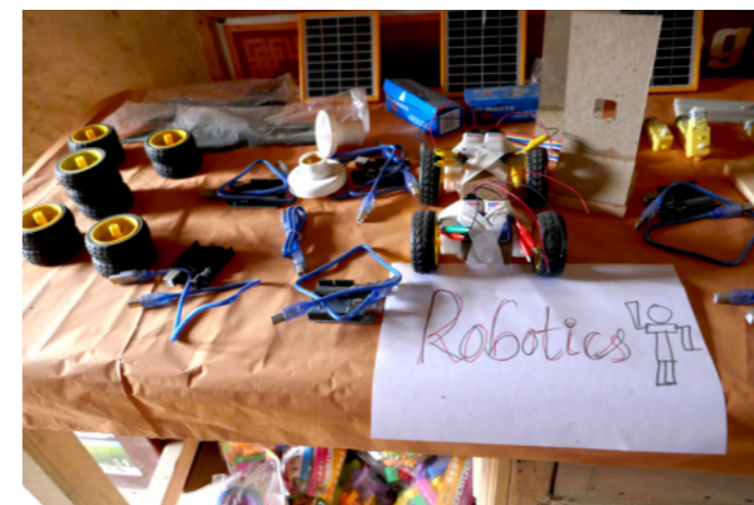
Neatly prepared school material for teaching robotics.