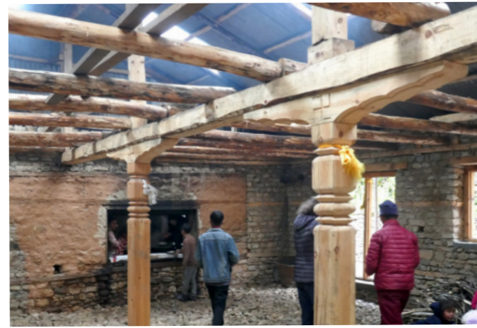
The shell of the new dining room is already being used extensively.