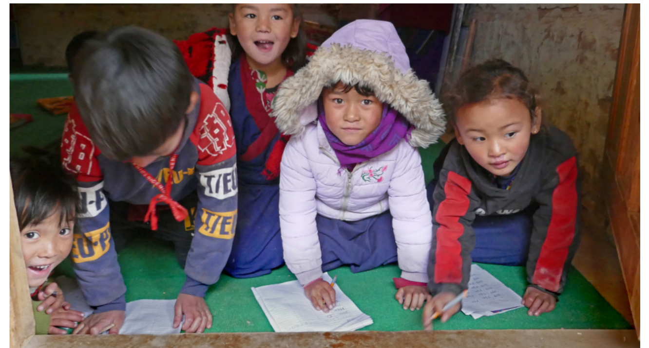
Well wrapped up, you can study outside even on cooler days.