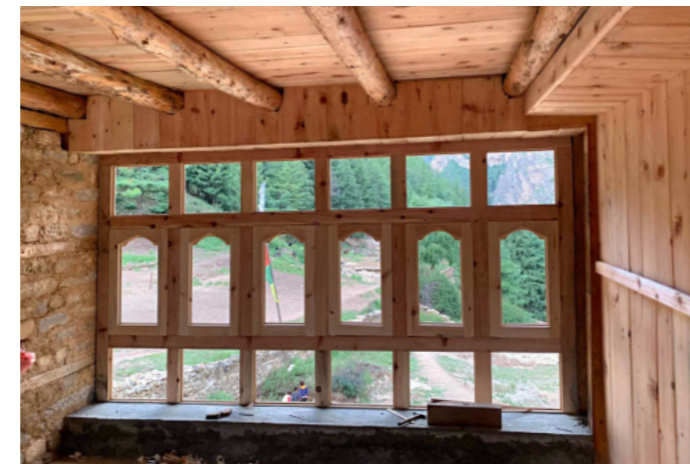
Large windows on both sides: view from the new staff room.