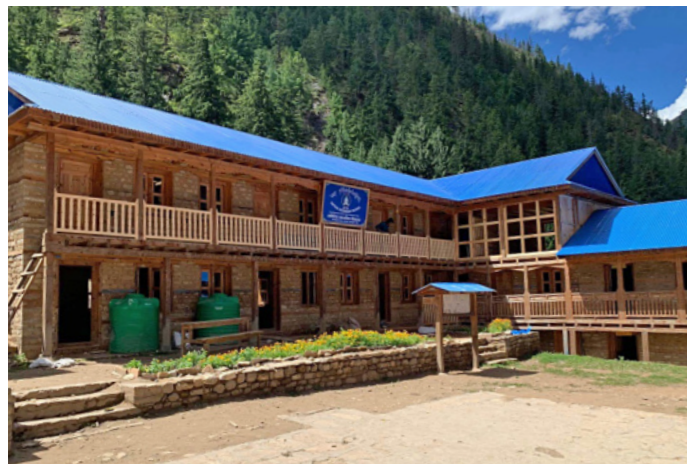
In the new section, there are classrooms and a staff room.

After six eventful days, we said goodbye to the children and all the teachers in the best of weather. Our journey took us back to Dunai and from there up another valley to the village of Do. There we met some former students and many other people who know and praise the Taprizia School.