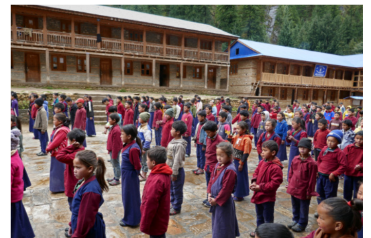
Morning assembly in the inner courtyard takes place in any weather.