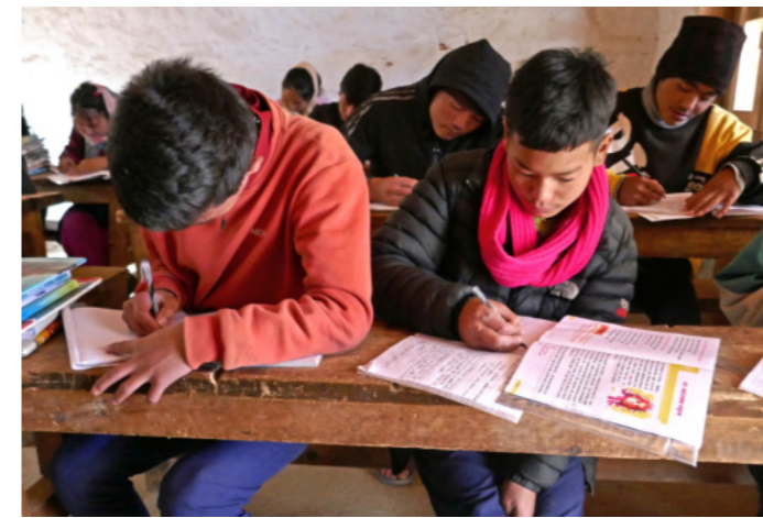
Everyday school life: concentrated work.