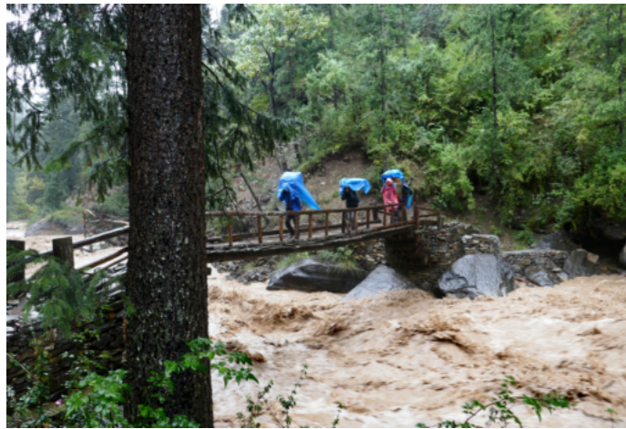
The constant rain turned harmless streams into raging torrents.