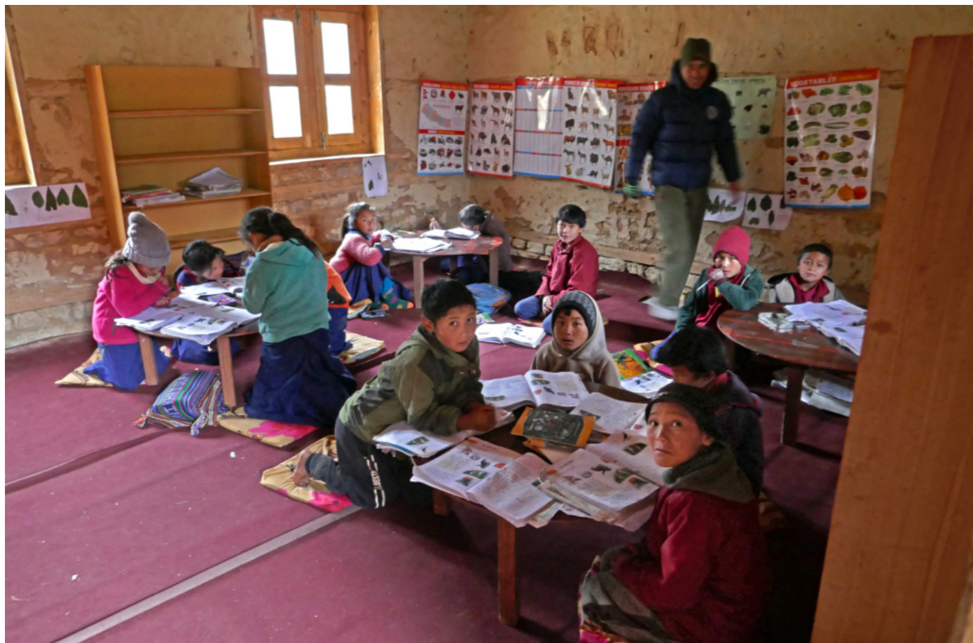
More interaction: The teachers training encouraged the staff to introduce new forms of teaching.