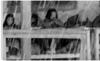
School lesson in the snow