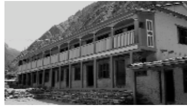
The new, colourful schoolhouse