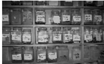
Tibetan medicine