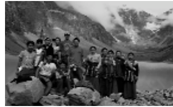
Schooltrip to Phungphu