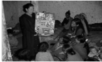
AIDS-Prevention in the village