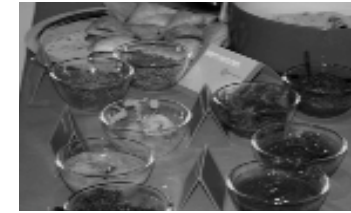
Appetisers at the Indian dinner