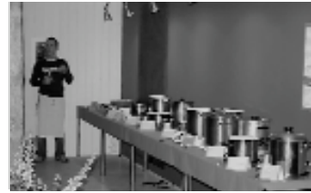
Cook Guruji opens the buffet ©M. Kind