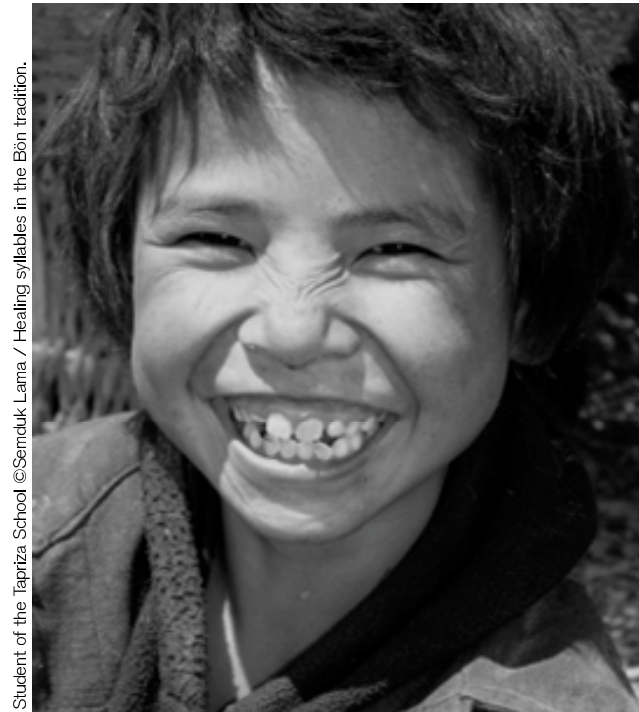
Student of the Tapriza School Healing syllables in the Bön tradition.

TAPRIZA SCHOOL AND PROJECTS IN DOLPO – NEPAL