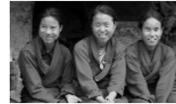
The oldest students